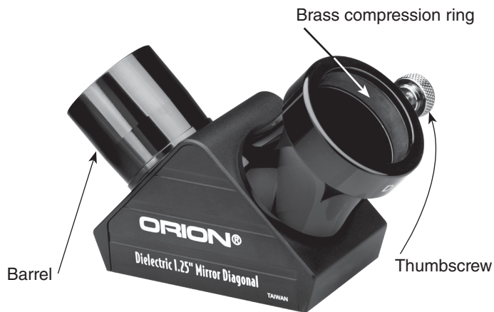
The Orion 1.25" High Reflectivity Mirror Star Diagonal

The 2" star diagonal will accept either 2" or 1.25" eyepieces using the supplied 1.25" eyepiece adapter. If using 2" eyepieces, remove the 1.25" adapter from the diagonal.